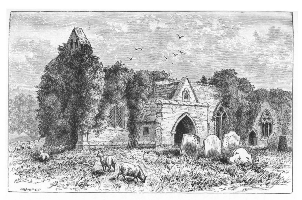
WYCLIFFE CHURCH, YORKSHIRE.